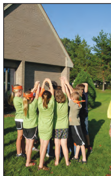
Members of the orange tribe work on interactive team-building outdoor activities during Vacation Bible School.